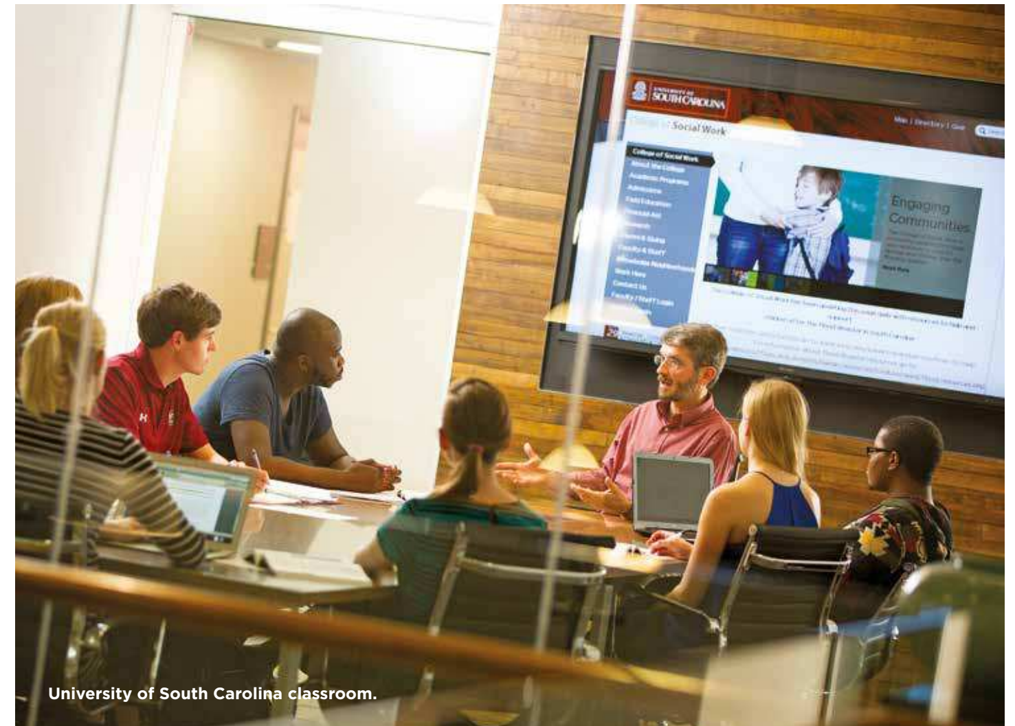
University of South Carolina classroom.

Source: 2017 U.S. News & World Report (unless otherwise stated)